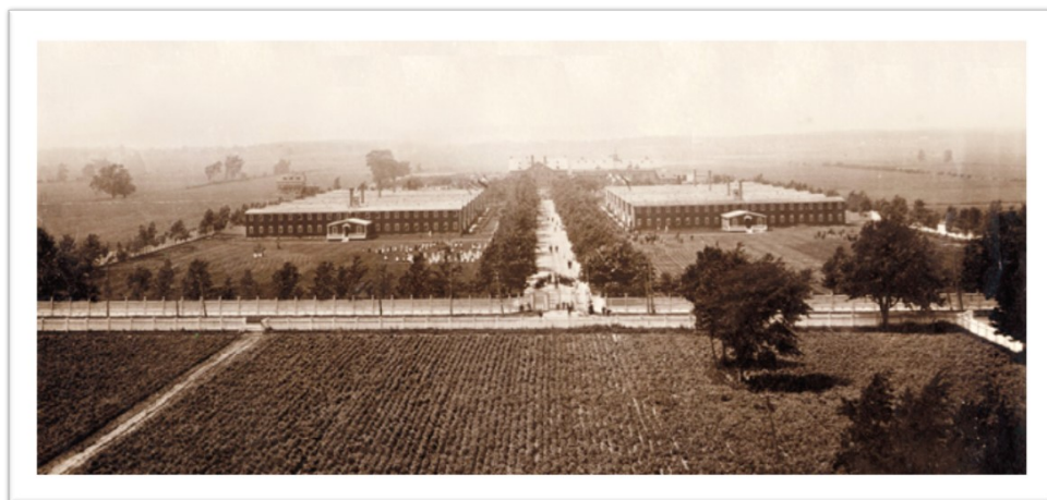
Saint-Jean-de-Dieu Hospital - Red pavilions Built after the fire, these pavilions welcomed the residents between 1890 and 1902.