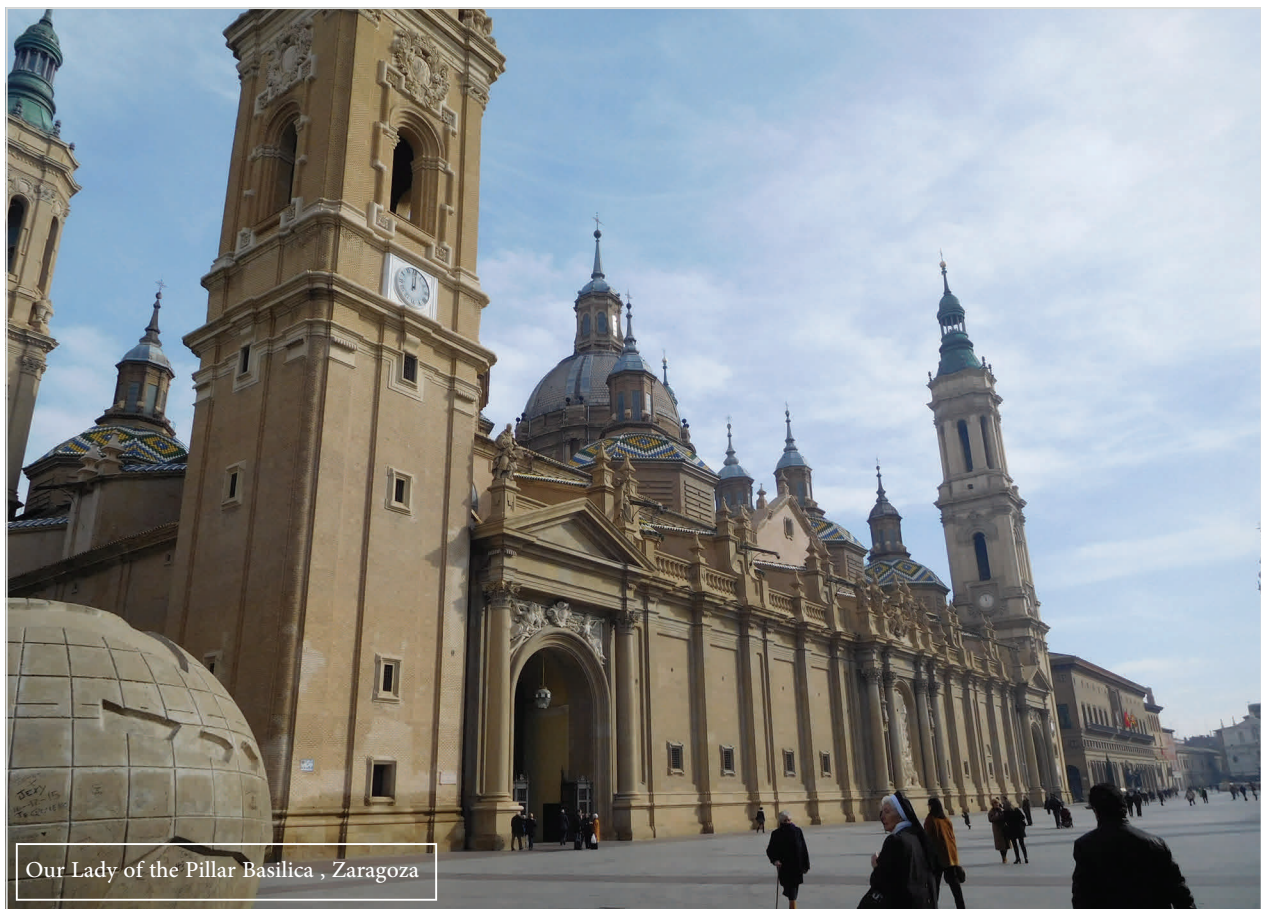
Our Lady of the Pillar Basilica , Zaragoza