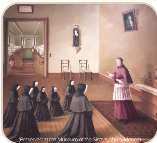
(Preserved at the Museum of the Sisters of Providence)

Seven young girls responded to the invitation of the bishop, and on March 25, 1843, for the feast of the Annunciation, a novitiate was founded at the Maison de la Providence (House of Providence), also called La Maison Jaune (The Yellow House). That morning, after singing the Veni Creator , Bishop Ignace Bourget celebrated Mass, and after the last Gospel 1 he addressed a few words to the newly admitted novices: