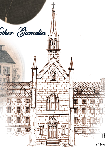
The Asile of Providence

Mrs. Nowlan, expected this outcome, since Emilie had already told her in a letter written 21 years before: "... I am attracted to the convent, since yesterday. I hope it will last... Do not tell anyone about this, I am telling you the truth...". Excerpt from the letter written by Emilie Tavernier to her cousin, Agathe Nowlan, on June 18, 1822.