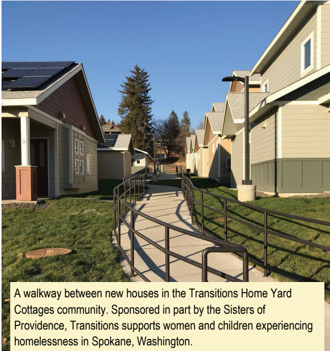
A walkway between new houses in the Transitions Home Yard Cottages community. Sponsored in part by the Sisters of Providence, Transitions supports women and children experiencing homelessness in Spokane, Washington.