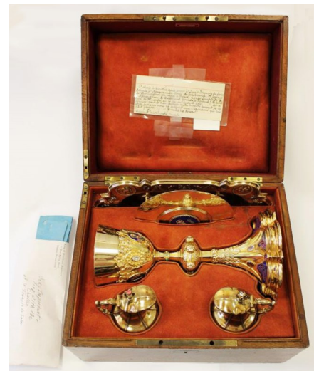
Liturgical set that belonged to St. Francis de Sales while he was a Bishop

The decorations that embellish the set are of a graceful beauty. Certain scenes and biblical characters are represented in a very colorful way, in addition to being enhanced with precious gems. The paten has a Latin inscription meaning: "This is the bread which came down from Heaven" . The set was received by the Museum of the Sisters of Providence, in Montreal, in January 2019.