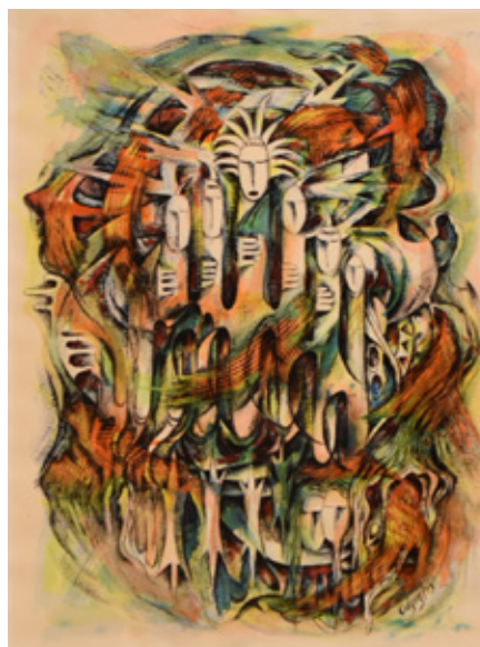
Daphne Odjig (1919-2016) Tribute to the Great Chiefs of the Past, 1973 Acrylic, graphite on paper 50.5 x 37.7 cm Laurentian University Museum and Arts Centre Collection, Art Gallery of Sudbury, (86.006).

At Pentecost, the apostles were "filled with the Holy Spirit" and enabled "to speak in other languages" so people from many lands from all over the region could receive the Gospel, "each of us, in our own native language". (Acts 2:2-12) This action of the Holy