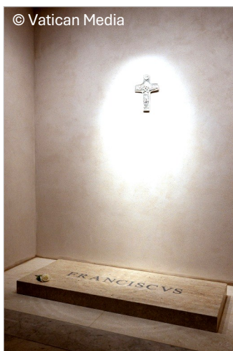
Tomb of Pope Francis at the Sainte-Marie-Majeure Basilica, in Rome.

Our beloved Pope Francis is buried near the little Pauline chapel with the icon of Mary Salus Populi Romani where he knelt in prayer before and after every trip. We felt the spirit of Pope Francis very near, especially his profound love for those who are poor and marginalized. This reinforced for me our own Providence mission and values and dear Blessed Émilie Gamelin's ministry.