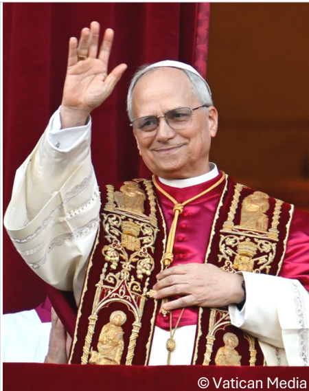
Pope Leo XIV as he appears on the central balcony of St. Peter's Basilica on May 8, 2025.

Eleven days after Pope Francis's funeral, on Wednesday, May 7, the Conclave gathered the 251 members of the College of Cardinals from around