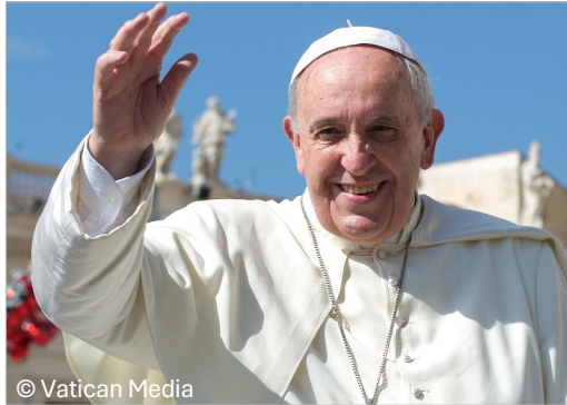
Pope Francis, in 2014

What an extraordinary month May has been! We have witnessed the 2025 Jubilee Year bringing us together as Pilgrims of Hope! We began the month mourning the death of our beloved Pope Francis who was called to his heavenly home on Easter Monday. He left us a rich legacy of how to live fully, until death, as a faithful loving servant of God's people, especially those who are least loved in society. His Easter Sunday blessing was a special gift to the world. His challenging words and actions throughout his papacy will continue to inspire and motivate us in our ministries. His memorable funeral on April 26 and the procession through the streets of Rome to his burial place were witnessed by the world through live stream.